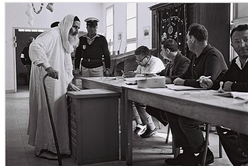
Elder Israeli citizen of Moroccan origin voting in the 1965 Israeli legislative election , Ashdod

population dispersal, there began to be signs of a struggle against the settlement coordinators who tried to halt the abandonment of settlements on the borders of Israel. The transition of Moroccans from villages on the frontier to the city and their rejection of an agricultural lifestyle was assumed to indicate their refusal to participate in productive enterprises and the Judaization of the land that the state intended for them, and an active strategy of dealing with separation and socialization processes which the country implemented in the 1950s. Discriminatory policies led to, among other things, an active protest whose two most prominent manifestations were the Wadi Salib events , led by David Ben-Arush against ongoing discrimination and the establishment of the Black Panthers movement . Their goal was to promote their social status and they fought passionately to earn their place in Israeli society. It took eighteen more years, after the events in 1977 in Wadi Salib for the North African immigrants to be heard clearly in national politics. In the 1977 revolution, their demographic power became evident where they succeeded in replacing the Mapai government by the Likud led by Menachem Begin . Many of the first and second generation of immigrants from Islamic countries (the "second Israel") felt that this change in regime would give them a voice and influence over the leadership of the state, which had previously been denied to them during Mapai's reign.