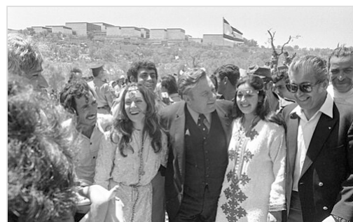
Moroccan Jews celebrating the Mimouna festival in Jerusalem, Israel, 1988

After settling in Israel, Moroccan Jews complained of discrimination and contempt from local Ashkenazi Jews . In 1950, the immigration office in Marseille handling prospective North African immigrants wrote that "these abject human beings" would have to be kneaded to shape them into Israeli citizens. Complaints were made about the influx of 'orientals', 'human refuse' and 'backward people'. Of the approximately 40,000 Moroccans who emigrated to Israel from 1949 to 1954, some 6% (2,466) returned to Morocco. [21]