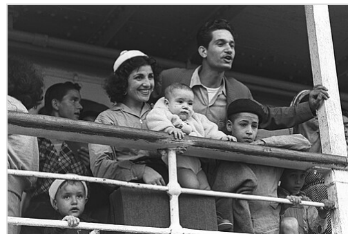
Moroccan Jewish immigrants arriving in Israel, 1954. From 1949 to 1956, Cadima migrated over 60,000 Moroccan Jews to Israel.

Cadima (Hebrew: קדימה) was the Zionist apparatus that oversaw the mass migration of Moroccan Jews to Israel from 1949 to 1956—about 90,000 in total, with a major escalation in the years preceding Moroccan independence. [9][13] The apparatus was administered by Jewish Agency and Mossad Le'Aliyah agents sent from Israel, with assistance from local Moroccan Zionists. [13] It was based out of an office in Casablanca and operated cells in large cities as well as a transit camp along the road to al-Jadida, from which Jewish migrants would depart for Israel via Marseille. [9] From mid-1951 to 1953, Cadima applied the Seleqseya (Hebrew: הסלקציה [14] ), an Israeli policy that imposed criteria for immigration that discriminated against poor Moroccan Jews, families without a breadwinner in the age range of 18–45, and families with a member in need of medical care. [15]